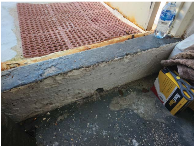
CONCRETE ROOF DECK